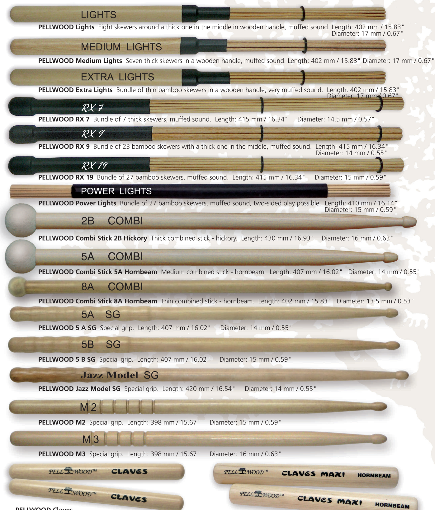
PELLWOOD Claves Resonant wood sticks. Length: 180 mm / 7.09" Diameter: 17 mm / 0.67"